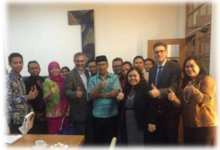
Program Launch with Bandung City Government