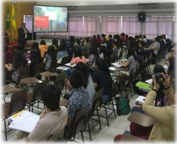
General Lecture at UNPAR