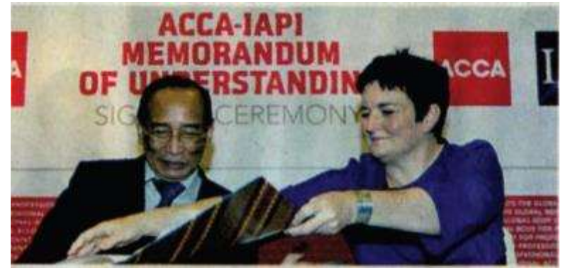
MRA process with IAPI (Institut Akuntan Publik Indonesia)