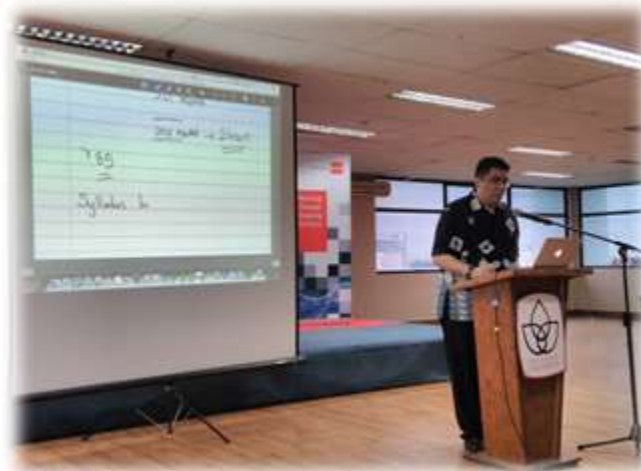
ACCA Introductory Class at President University