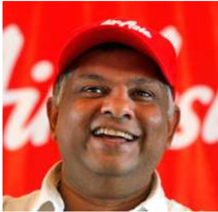
Tony Fernandes Founder & CEO, Air Asia