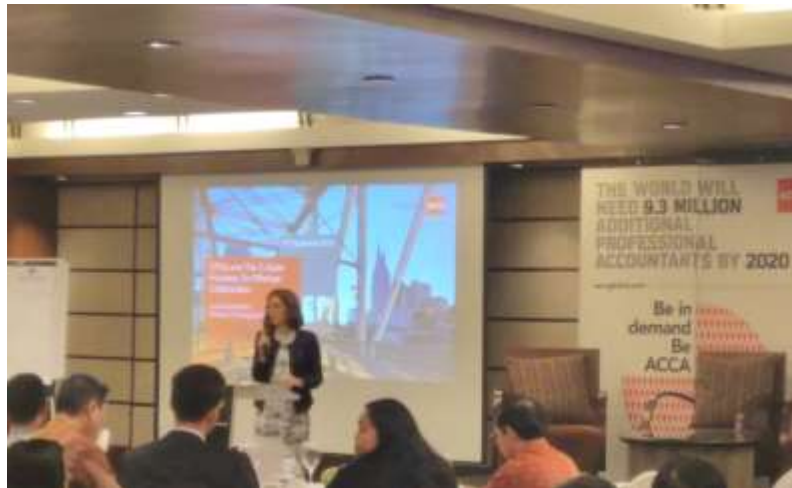
Joint CPD with IAI – September 2016