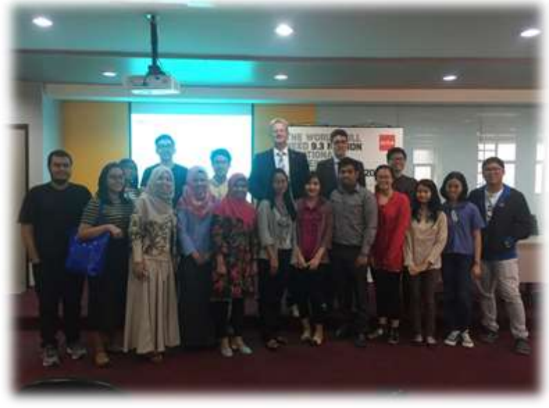
General Lecture at UI