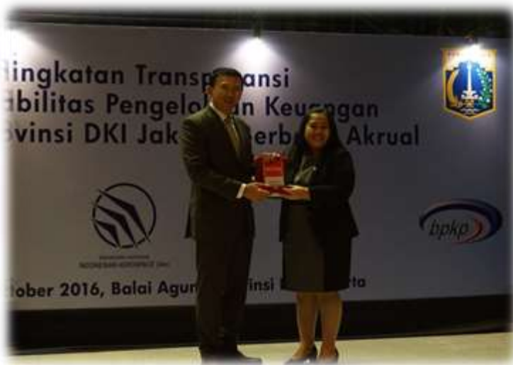
Program Launch with Jakarta Provincial Government

Business environment improvement through Government Auditors & Finance Officer (GAFO) Capacity Building Program in International Public Sector Accounting Standards (IPSAS) in collaboration with British Embassy.