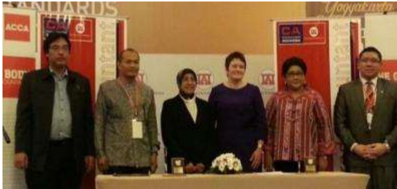
Mutual Recognition Agreement / MRA process with IAI (Ikatan Akuntan Indonesia)