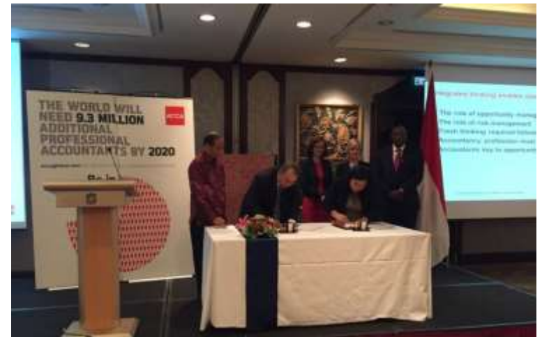
Joint CPD with IAPI and Strategic Partnership Agreement Signing – June 2016